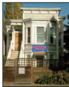
743A Addison Street

What's New at General Printing As we progress into our 36th year in business we are enjoying working from our centrally located, corporate office headquarters in west Berkeley. Our plans for 2008 call for expanding our book publishing. We have several new titles in development. We have found the climate for the printing of books and publications remains favorable in the certain niches where we are working. We also plan to expand our digital color printing as that business sector is growing rapidly for us. We find that as the costs of digital printing have declined, the quality and diversity of products we can offer continues to improve.